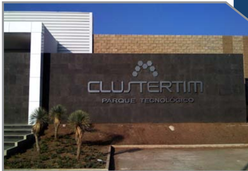
ClusterTIM Technology Park in Morelia, Mexico

Scio Consulting International, LLC 6580 Via del Oro San Jose, CA 95119 www.sciodev.com